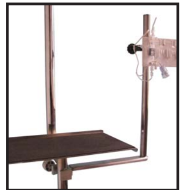
Steelcraft #12578LL Horizontal 18" mounting tube for full transducer height adjustment

EVERY ACCESSORY ALL SOLID STEEL CONSTRUCTION - NO BREAKABLE PLASTIC