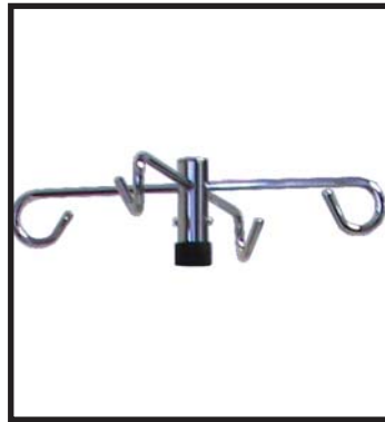
Steelcraft #405-4 Standard four hook ram's horn style fluid holder