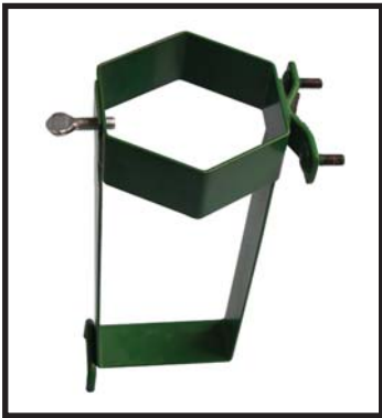
Steelcraft #404ET Clamp on O2 cylinder support bracket - No breakable plastic rings