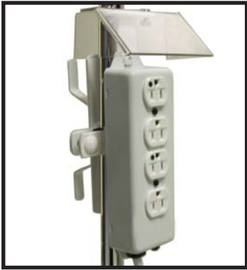
Steelcraft #401PP 4-plug certified hospital grade power strip with cord wrap