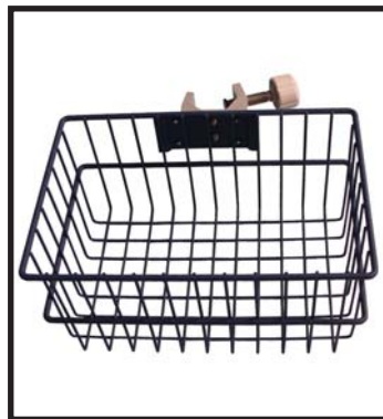
Steelcraft #407B Clamp on accessory basket