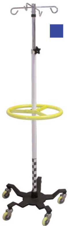
■ #2097SR IV Racer