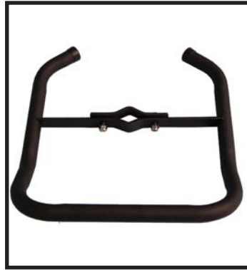
Steelcraft #402AT Clamp on transport handle for patient ambulation and device protection