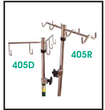
Steelcraft # 405D Steelcraft # 405R Innovative designs for better line identification