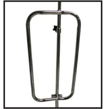
Steelcraft #403MP Quad frame adapter to support four pumps on a single upright