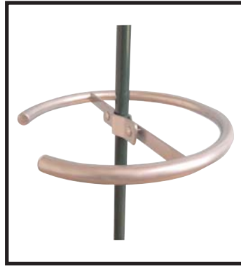
Steelcraft #402C Circular handle for greater ease of device transport and/or patient ambulation