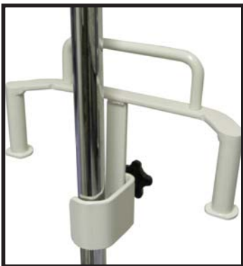
Steelcraft #406DP Dual pump tandem carrier for multichannel capability with your current devices